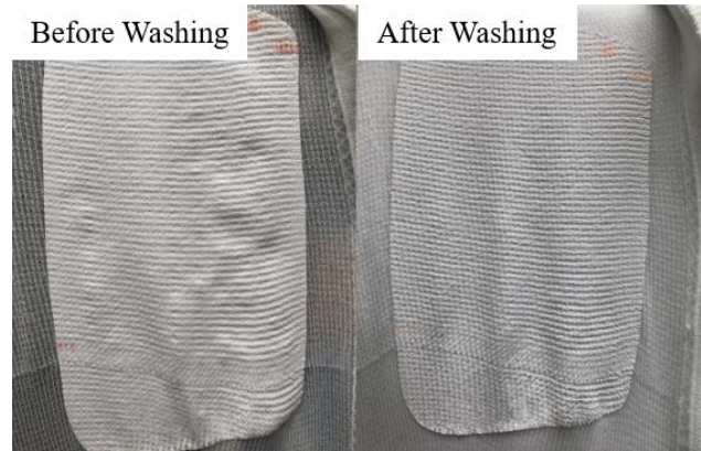
Figure 3: Image of single layer of polyurethane interfacial layer before and after washing cycle.

8 washing cycles without any damage. No cracking or delamination of the interfacial layer was observed. This result suggests that neither the wearable fabric nor the interfacial layer will be the limiting factor for the printed electronics.